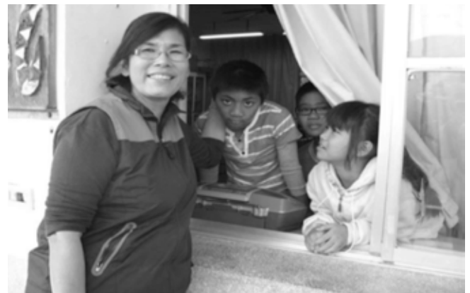
學校的寶貝們 Our precious children at school