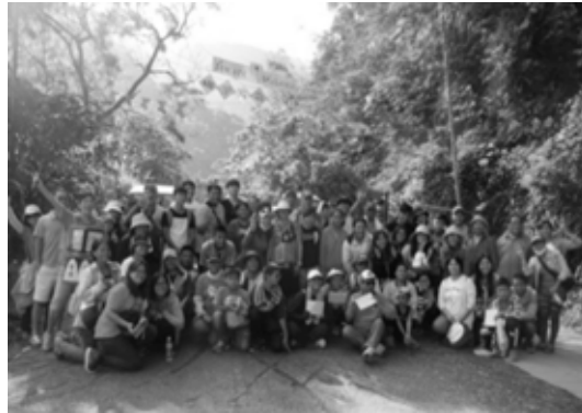
“排灣方舟之旅”的登山隊伍 “Paiwan Journey of Ark” expedition team members

我親愛的寶貝們! 讓我來輕輕地摸著你們, 暖暖地把手放進主耶穌的大手中, 勇敢地說出你們心中的夢想, 讓祂帶著你們飛。寶貝們! 越過烏雲就是陽光。