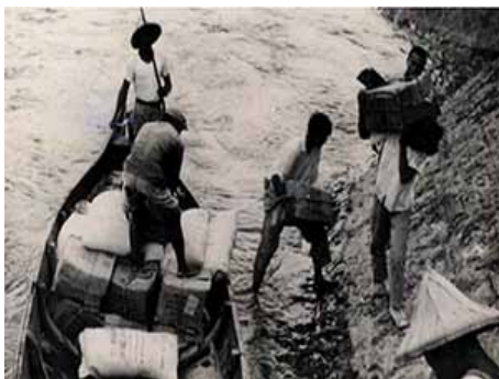
跋山涉水， 照顧偏鄉 病患

Proverbs 3:5-6 “Trust in the Lord with all your heart, and do not rely on your own insight. In all your ways acknowledge him, and he will make straight your paths” Or, as my Mother would say: “Trust and Obey.”