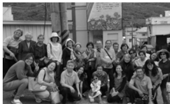
從市區來的代禱與支持 Supporters and prayers partners from the city

2015年五月十六日, 感謝教會與地方的參予, 完成了「排灣方舟之旅」的創舉。當天共約一百人參與。全程約四十公里, 我們步行攀登了最困難的九公里。路經四個部落, 從台坂部落經土坂部落, 新興社到新化部落。