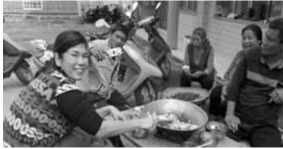
左鄰右舍的分享 Sharing with neighbors

要將近三個小時，山路彎曲，常有落石。因著土坂據點位置，一直沒出現，所以開始考慮，離土坂有20分鐘車程的台坂部落，到台坂一切都非常順利，據點位置在第一天就出現了。